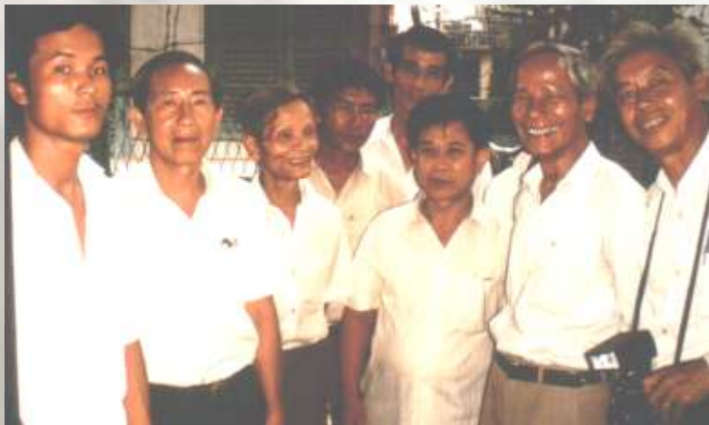
Many of the friends at our gathering