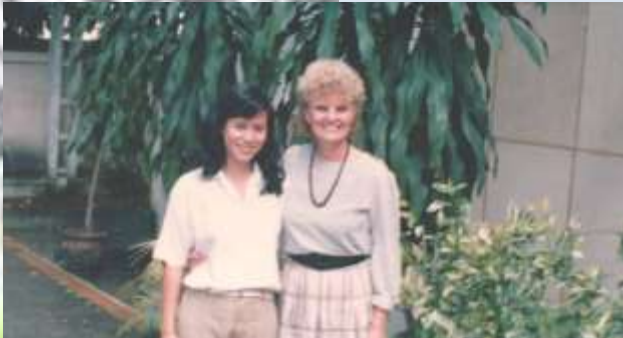
My government assigned translator and friend