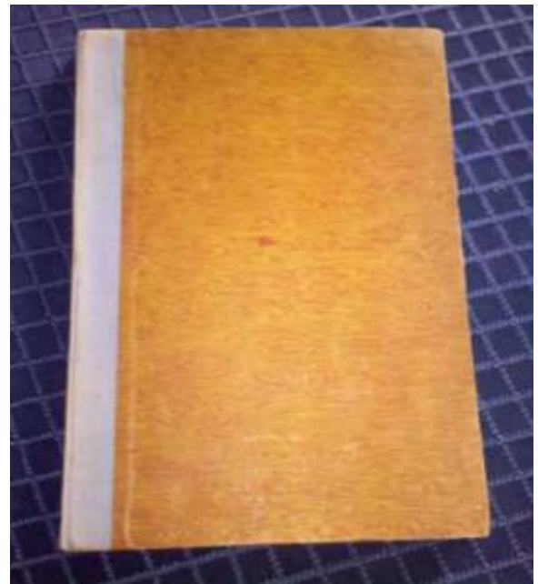
Handwritten Vietnamese Prayer Books...copy given to the Universal House of Justice