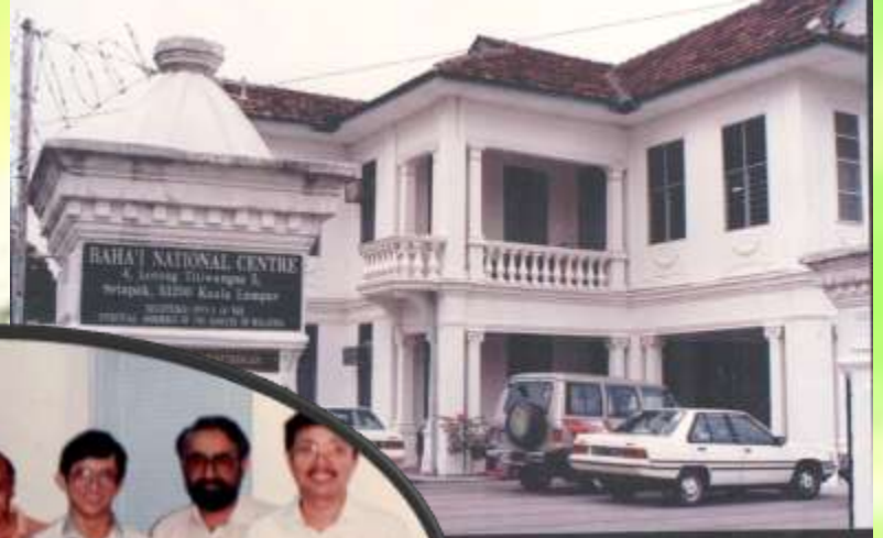
National Baha'i Center in Kuala Lumpur, Malaysia