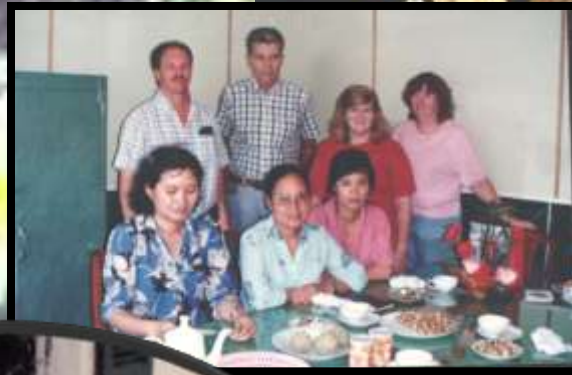
Working with some orphanages