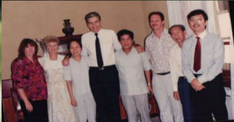
Meeting with the Minister of Education and friends