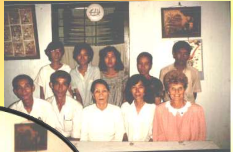
First visit: Commemoration of the Martyrdom of the Bab