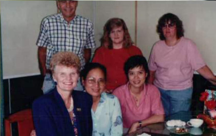
Meeting with Orphanage Directors and staff.