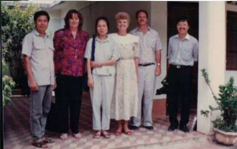
Outside one of the Orphanages