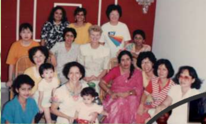
A gathering with the women