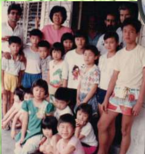
Assisting with Children's and Junior Youth Classes