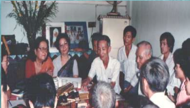
Consultation with both Counselors