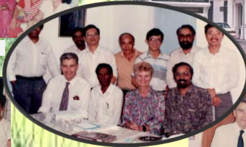
Meeting with the NSA in Malaysia