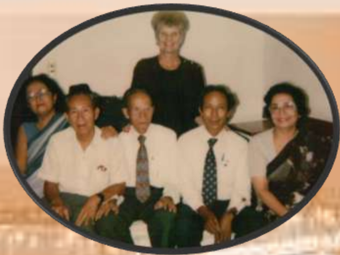
Meting with the friends in Da Nang